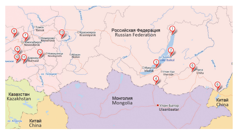
Fig. 3. F. tularensis spreading map, received from Center of hygiene and epidemiology in Altay territory and Irkutsk scientific and research anti-plague institute: